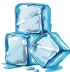
as cold as ice