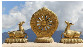
The Dharma wheel

The lotus flower - Even from a murky start, humans can achieve enlightenment.