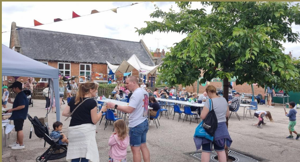
180 th Anniversary celebration